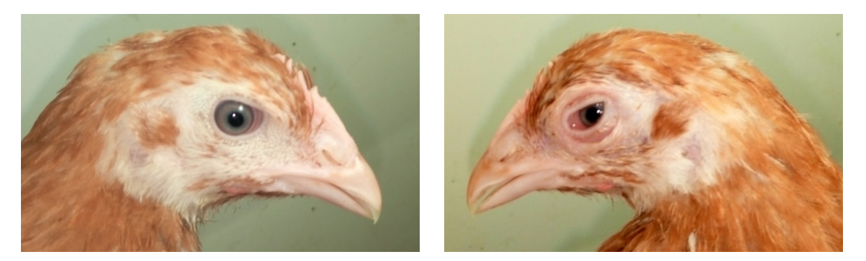
Fig. 1. Typically occurring eye reaction on Day 6 post ocular vaccination (right) compared to a healthy eye (left)

authorized in the RF using the ciliostatic test, clinical observations and serological monitoring.